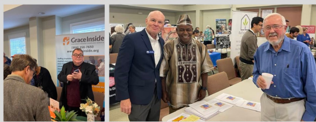
& 2ND ANNUAL MISSIONS FAIR