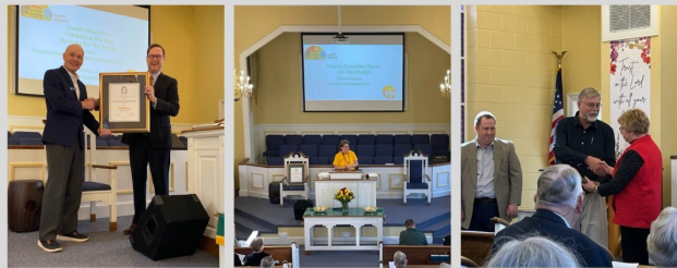
240TH ANNUAL MEETING