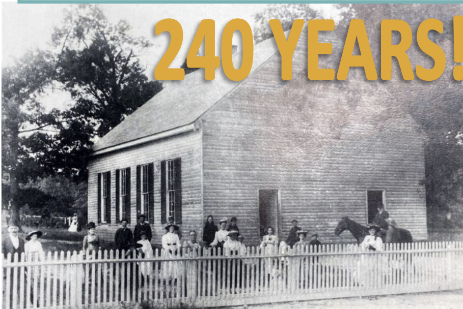
Early photograph of the Old Dover Meeting House

This year I have walked on hallowed grounds. In the Spring, I walked in the footsteps of Jesus. I walked in Bethlehem where perhaps Jesus took His first baby steps. I walked in Cana and stood beside a stone waterpot, carbon dated to the time that Jesus would have stood there ordering the servants to fill them with water, and He would miraculously turn into the finest wine. I walked down the Via Dolorosa (Latin for Way of Suffering), where many theologians believe Jesus stumbled along in agony through the Old City of Jerusalem, on His way to the Cross.