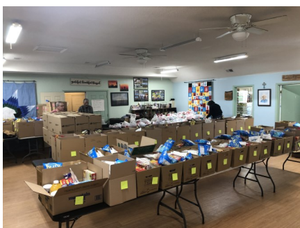
Preparing 130 food boxes for the residents of Cannon Ball, ND.

Flexibility: If you have ever been on a mission trip you know the importance of flexibility. What we plan to do doesn't always go as we intended. The beauty of this is that God always engages us in ways that better suit His plan and doesn't waste our time or effort. On the reservation, our mission partners at Tipi Wakan have adapted their food pantry ministry by making it a Drive-thru pantry. As you consider the mission activities of your church, how might you need to adapt or be flexible? Join us for a Mission Dialog discussion on March 11th at 10 a.m. or 6:30 p.m. Thank you for all the ways you engage and support the work of Dover Baptist Associational Churches!