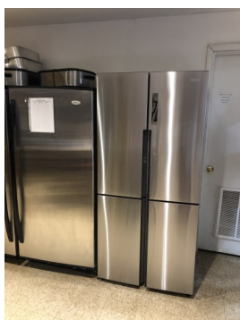
Thanks to your Watson Associational Mission Offering gifts, Tipi Wakan was able to purchase new kitchen equipment for their ministry center kitchen.