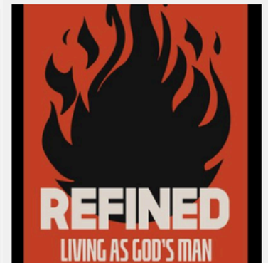
REFINED (TEEN BOYS)