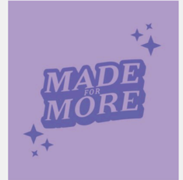
MADE FOR MORE (TEEN GIRLS)