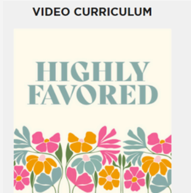
HIGHLY FAVORED (TEEN GIRLS)