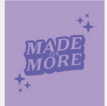
MADE FOR MORE (TEEN GIRLS)