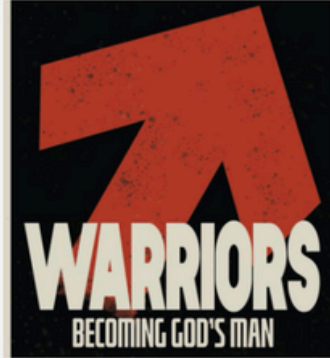
WARRIORS (TEEN BOYS)