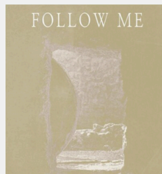
FOLLOW ME (WOMEN)