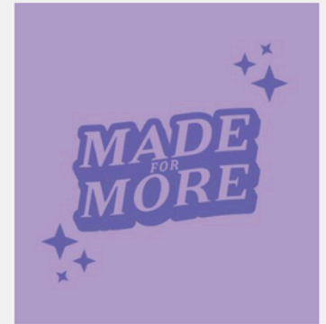
MADE FOR MORE (TEEN GIRLS)