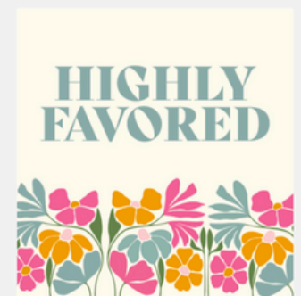
HIGHLY FAVORED (TEEN GIRLS)