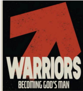
WARRIORS (TEEN BOYS)