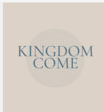
KINGDOM COME (MISSION TEAMS)